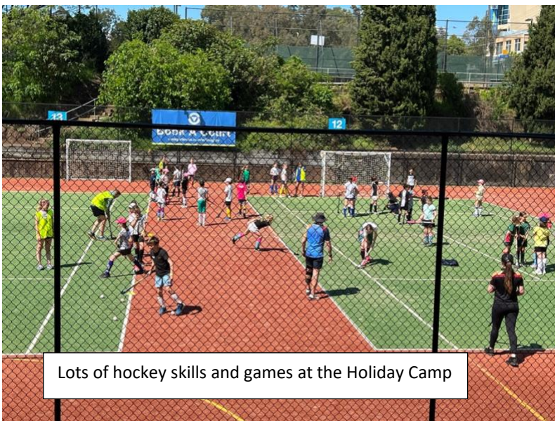
Lots of hockey skills and games at the Holiday Camp