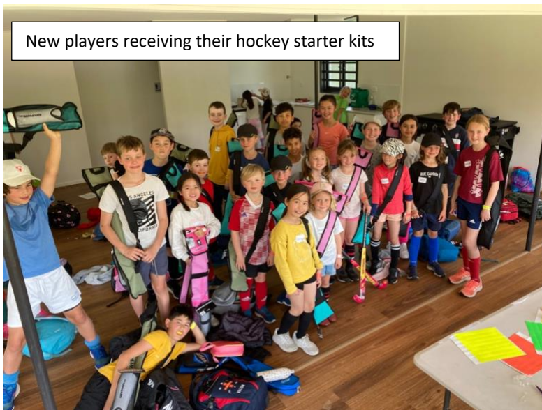
New players receiving their hockey starter kits

Day 2! It was a huge success for everyone involved. Any new player who attended the Camp was also gifted a Hockey Starter kit including stick, shin pads, ball and bag! There were lots of happy, excited kids!