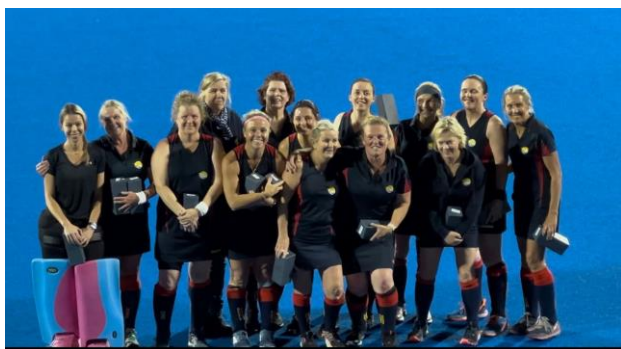
NSB2 – 2 nd Div 2