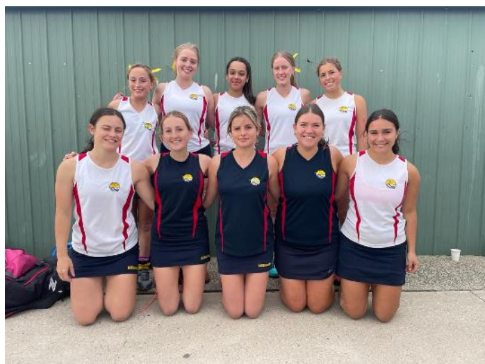
Top age u18 girls – their last field state champs with NSB!