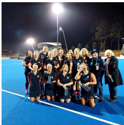
NSB3 – 2 nd Div 3