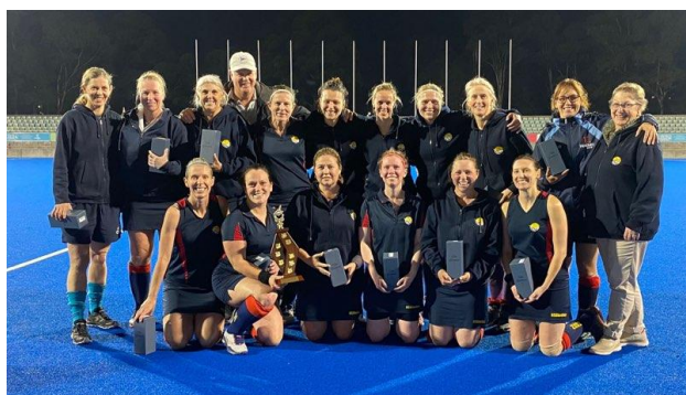
NSB 1A – Winners Div 1