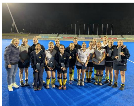
NSB UTS (White) – 2 nd Div1