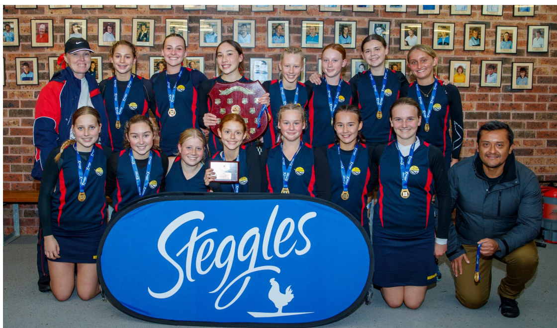
2021 Division 1 State Champion U15G Team