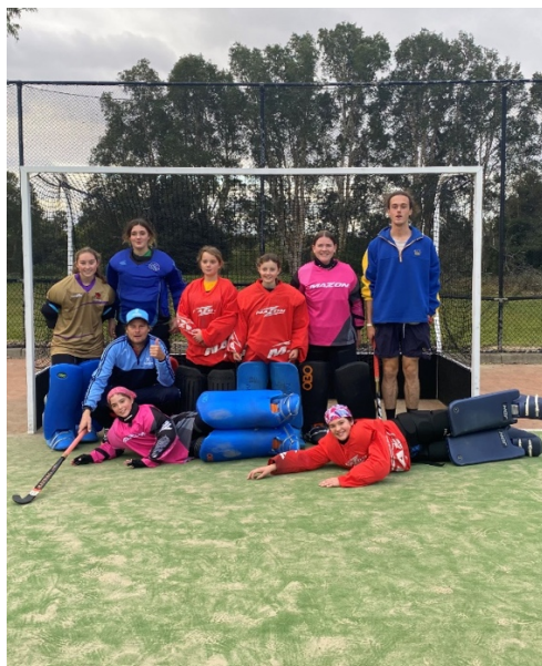
NSBHA Goalkeepers U11 – U18 girls and boys