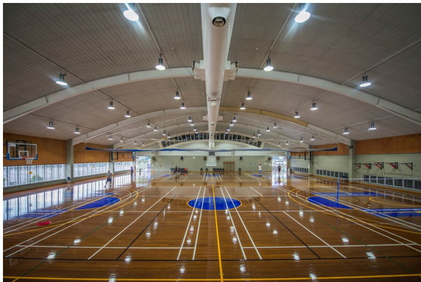
Willoughby Leisure Centre (Willoughby Council)

I would also like to take this opportunity to thank the NSBHA Executive for their tireless work and ongoing support of the rep program.