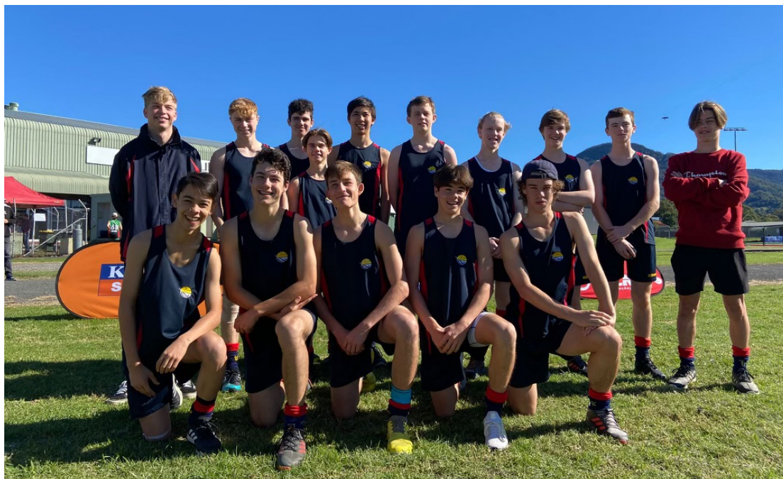
2021 Division 3 State Champion U18B Team