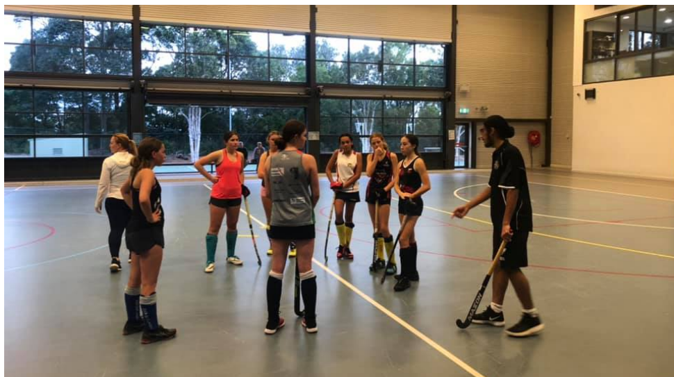
U18G Indoor Development Program

As we approach the end of the calendar year the NSB Indoor program is commencing with some exciting new developments: